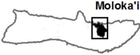
Figure 2. The Pelekunu Preserve is on the north shore of Molokai. The job will require helicopter access. DOFAW will provide helicopter access to/from the site.